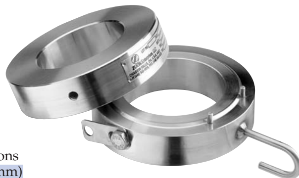
Holder Dimensions Inches (mm)

Gauge tap; nipple and tee; excess flow valve; pressure gauge; special facings and coatings