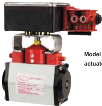
Model VPS and P1 mounted on an actuator with a positioner mounted on top.