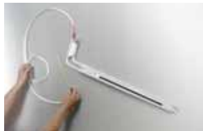
Model 1227 mounted in incline position.

Series 1227 Manometer, Most versatile and useful low cost manometer we know of. Designed for installation and servicemen. A sturdy, clear plastic manometer, it offers single, direct readings in two ranges: As a U-tube, it reads from 0 to 16" of water; as an inclined gage, it reads from -.20 to 0 to 2.6" of water. Model 1227M (Metric) is 0 - 400mm water column as a U-tube and -5 to 0 to 70mm water column as an inclined gage. "How-to-use" instructions are printed directly on the scale.