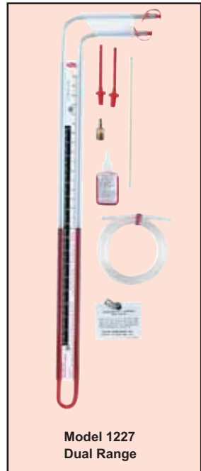
Model 1227 Dual Range