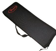
Soft Carrying Case Included with Every Unit