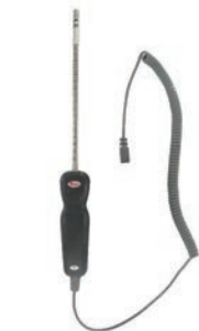
Replaceable Probe with Secure 6 Pin Adapter