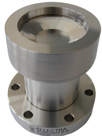
Pressure Burst Disc low pressure version on 40CF