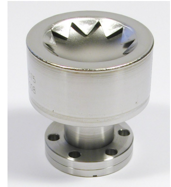
Pressure Burst Disc standard version on 16CF