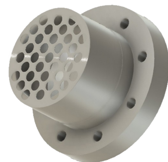
The Ultra Low Pressure Burst Disc with a rupture pressure below 0.5 bar on 63CF flange. With this component, the overpressure regulations do not apply for the system. Mem Cover to prevent accidental damage to the membrane