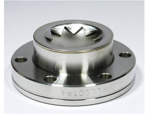
Pressure Burst Disc standard version on 40CF

DN40CF and DN16CF versions / KF types and custom flanges, ULP version needs 63CF or ISO63 flange