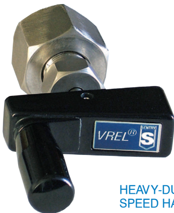
HEAVY-DUTY SPEED HANDLE