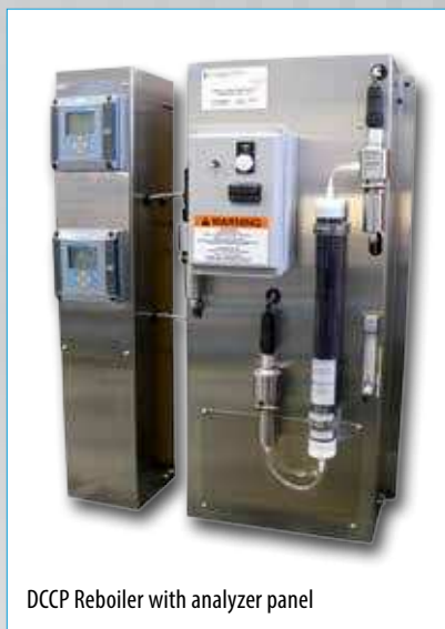
DCCP Reboiler with analyzer panel