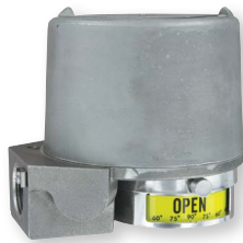
Mark 1 stainless steel (environmentally sealed for corrosive areas)