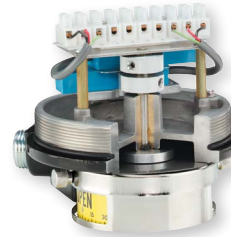
Mark 4 thru-shaft cutaway Model 42RDOJ2