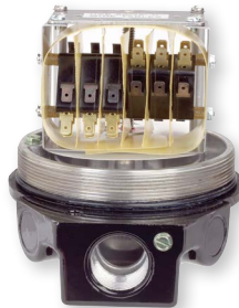
Mark 3 multi turn