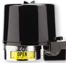
Mark 1 polyester coated aluminum (environmentally sealed for corrosive areas)