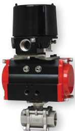
Mark Series mounted to an actuator