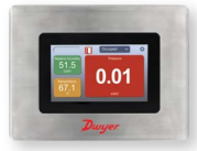
RSME with stainless steel