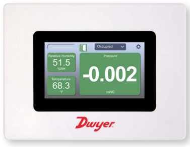
RSME with standard plastic bezel