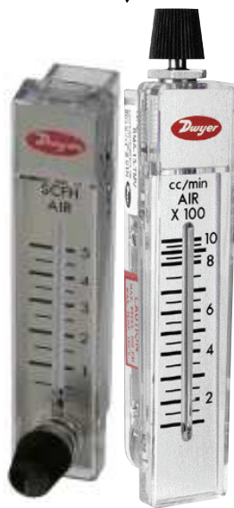
Modello RMA Scala alta 50mm