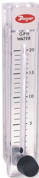
Modello RMB Scala alta 125mm