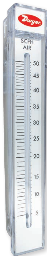
Modello RMC Scala alta 250mm

Su ogni modello (RMA/RMB/RMC) è disponibile anche la versione con valvola, e a vostra scelta se su ingresso o su uscita