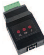
PMA-07, Isolated PMA-08, Non-Isolated