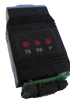
PMA-04, Isolated PMA-05, Non-Isolated