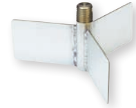
PDL-2 Minimum bulk density of 30 lb/ft 3 (481 kg/m 3 ).