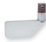
PDL-4 Minimum bulk density of 70 lb/ft 3 (1122 kg/m 3 ). Fits through 1-1/4" coupling eliminating the need for a mounting flange.