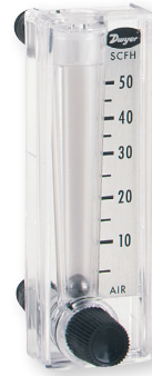
Model MMF-50-PV 1-1/2" scale, with metering valve, knob.