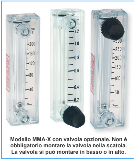
Modello MMA-X con valvola opzionale. Non è obbligatorio montare la valvola nella scatola. La valvola si può montare in basso o in alto.