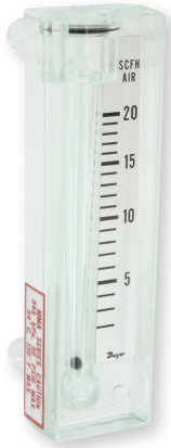
Standard model MMA-X-LV

2" or 1-1/2" Scale, Configurable Valve Option