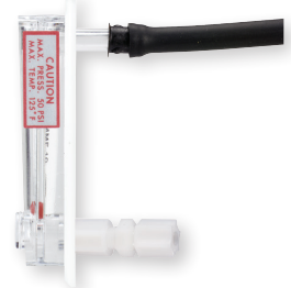
Model MMF connections. Connector at top, installed in panel, has retainer and flexible tubing in place. Connector at bottom shows alternative connection with metal or rigid plastic tubing, using a double compression nylon tube union (as Dwyer Part No. A-328).