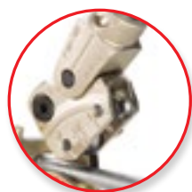
Roller Dies Reduce Force and Tube Flattening