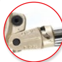
Easy 90° to 180° Switch! No Crossing of Handles!