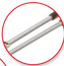
Ergonomic Cushioned Grips, Comfortable Use!