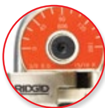
Clearly Visible Degree Marks for Accurate Bending