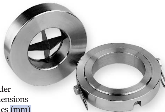
Holder Dimensions Inches (mm)