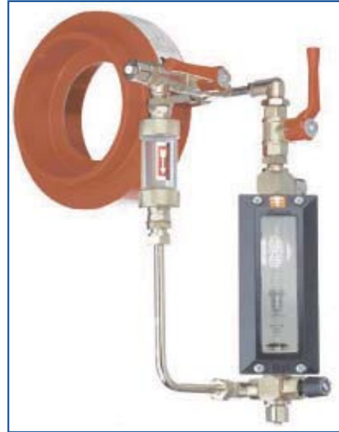
TYPICAL HORIZONTAL PIPE VERSION - FLOW LEFT TO RIGHT