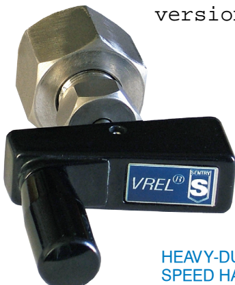
HEAVY-DUTY SPEED HANDLE