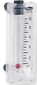
Model MMF-10-TMV with top-mounted valve- for vacuum service. Use screwdriver to adjust.