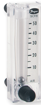
Model MMF-50-PV 1-1/2" scale, with metering valve, knob.

Modello MMA-X con valvola opzionale. Non è obbligatorio montare la valvola nella scatola. La valvola si può montare in basso o in alto.