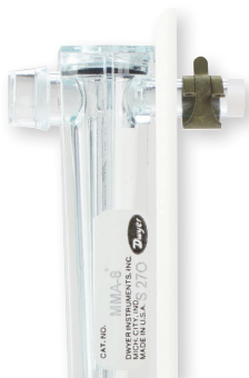
Spring retainers on connection tubes secure panel mounted MMA-X. Compression union, P/N A-327 shown.