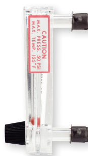
Model MMF mounts easily from front of panel. Drill two 9/32" or 5/16" dia. holes in panel on 2-1/16" centers. Insert mounting connector spuds. From rear, slide on the two spring retainers (furnished) and push on rubber or plastic tubing.