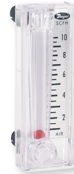
Model MMF-10 with 1-1/2" scale, no valve.