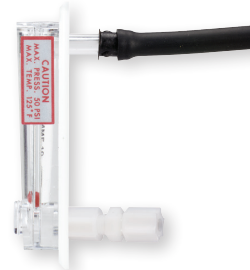
Model MMF connections. Connector at top, installed in panel, has retainer and flexible tubing in place. Connector at bottom shows alternative connection with metal or rigid plastic tubing, using a double compression nylon tube union (as Dwyer Part No. A-328).