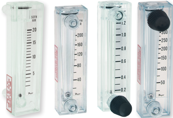
Standard model MMA-X-LV

2" or 1-1/2" Scale, Configurable Valve Option