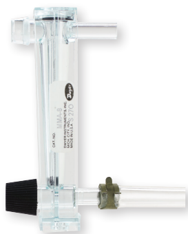
MMA-X tubing connections secured by clamp. "Standup" mounting clip shown.