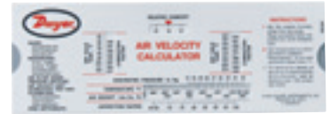
Handy A-532 Slide Chart speeds air velocity calculations. All plastic, stays clean for years. Included with each Pitot tube.